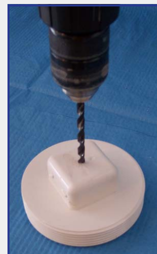
Figure 4: Drilling the Hole for the Eyehook