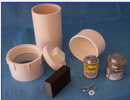
Figure 1: Bird House Components