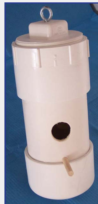
Figure 6: Setting Up for Primer and Paint

Being that your new bird house is made from Heavy PVC pipe and fittings, it should last you a live time. It's easy to hang and easy to clean at the end of each season.