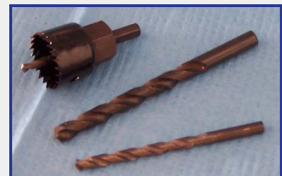
Figure 2: Drill Bits