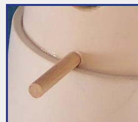
Figure 6: Installing the Dowel